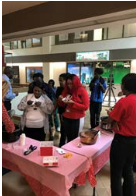
Let's get some chili