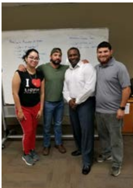
City College Miami business students

Find us on Facebook. Visit the City College social media link at citycollege.edu/social