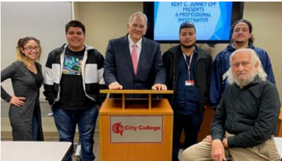
City College Miami Private Investigation Services