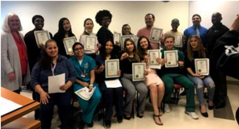
Congratulations to all our newest Honor Society members