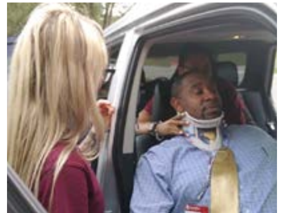
Stabilizing the injured driver