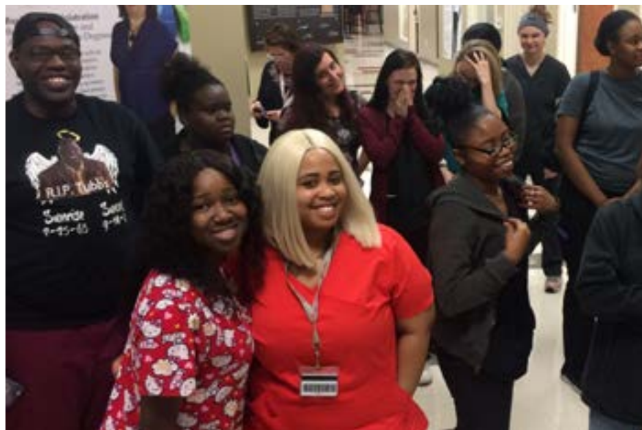
Black History Month Scavenger Hunt launches and students gather for instructions