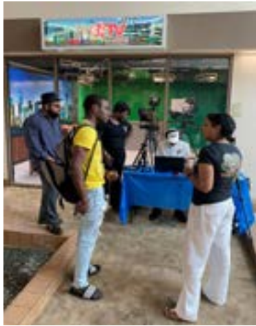
Student with the staff of Flexx FM Radio

Over twenty companies attended the fair offering a variety of jobs. Employers were also provided a brunch sponsored by Pollo Tropical . Students and