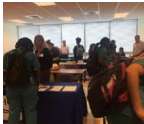
Students engaging with employers during Career Fair

Biomat, Sweet Tomatoes, and Cangene Plasma Resource. The students were very engaged with the representatives and excited about the possibilities presented to them for their futures. Future career fairs are in the planning to keep this momentum going forward.