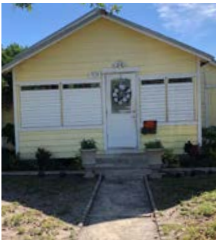
After the clean up: front yard

Find us on Facebook. Visit the City College social media link at citycollege.edu/social