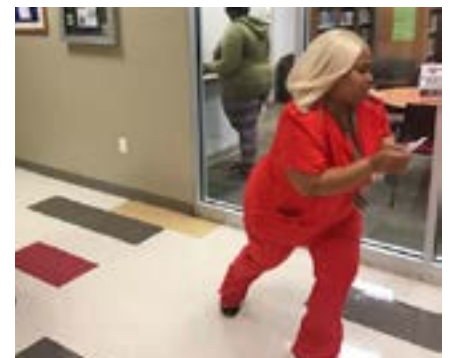
Spirited run to the next clue