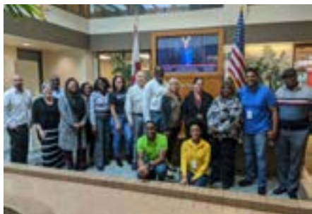
Participants and Microsoft Educators

On January 24th the faculty and staff at Fort Lauderdale Campus participated in an in-service training sponsored by Microsoft Education Innovation team. The Microsoft Educator Community provides on-demand courses that focus on integrating technology into teaching and how to use tools like OneNote, Teams, and Office 365. The training focused on skill development and mastering Microsoft products in a learning path, a collection of courses for deeper learning.