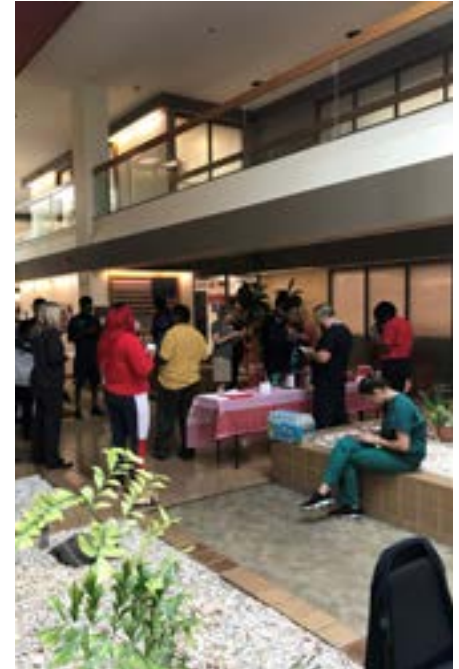
Judging the chili

Biomat, Sweet Tomatoes, and Cangene Plasma Resource. The students were very engaged with the representatives and excited about the possibilities presented to them for their futures. Future career fairs are in the planning to keep this momentum going forward.