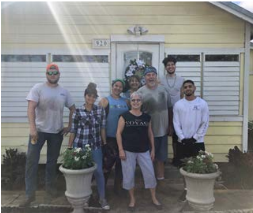
Cat rescue volunteer work force