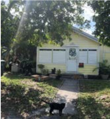
Before the clean up: front yard

The landscaper cleared away dead branches and did pruning. With his guidance, students cleared the area for new planting and did some mulching. The students also did some painting, and created beautiful areas with new statuary.