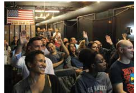
An engaged audience eager to interact at the Product Pitch Competition