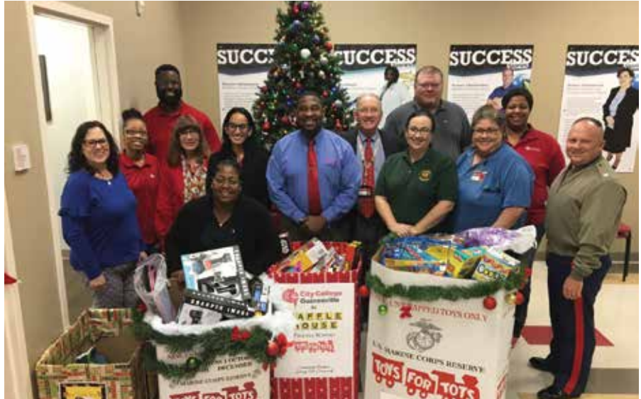
Staff pose with the Marines at Toys for Tots pick up

The Gainesville staff and faculty collaborated on this year's rendition of Toys for Tots . Once again we partnered with the U.S. Marines to bring a little holiday cheer to a local child's life. The local outreach includes support for more than 3,000 local families. The Gainesville campus has participated in this joyous endeavor for the past 3 years. This year, one of our business partners, Waffle House , put up one of the donation boxes in their local stores and transported those gifts to the campus for collection by the Marines. It was exciting to have the Marines have to come back to campus as we donated more gifts than they had room to transport on one trip. Thank you to all who participated this year.