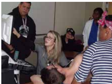
Pointing out the benefits of the new technology

Students saw the same image in both 2D and 3D, which made it clear how much more information is available with this next generation of machine.