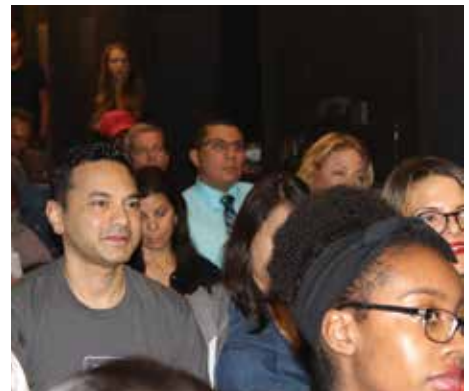
Students from the Fort Lauderdale campus business program attend the Product Hunt Pitch event