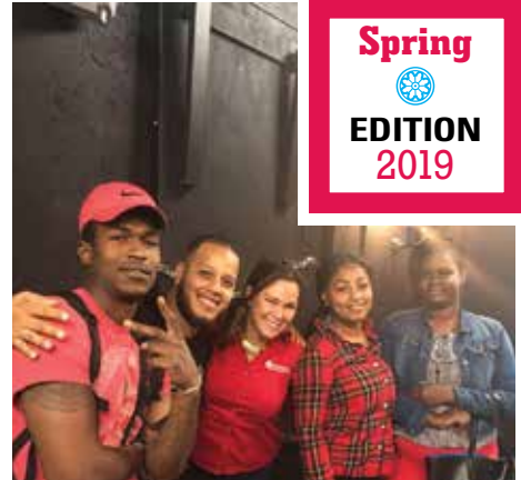
Students from the Fort Lauderdale campus business program attend the Product Hunt Pitch event