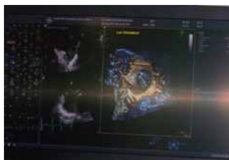
2D imaging on left, 3D imaging on right