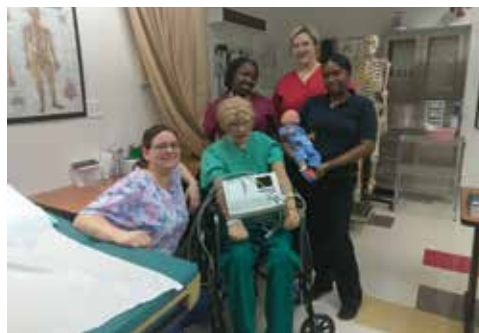
GVL MA Students welcoming Trixi the MA Mannequin to the Gainesville campus