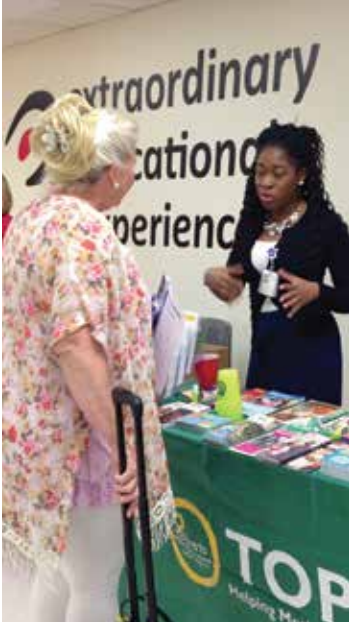
A student speaks with a local vendor