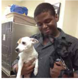
A happy client with two patients never to be lost again

The students scanned each pet first to make sure a microchip was not already present. Students then gained experience inserting the microchip, via an injection, between the pet's shoulder blades; and scanned again to confirm the proper insertion and placement. Once the microchip was in place, the students demonstrated to the client how the pet's microchip