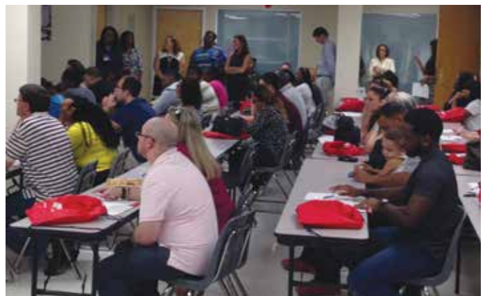
Students and faculty gather to announce awards and celebrate the students