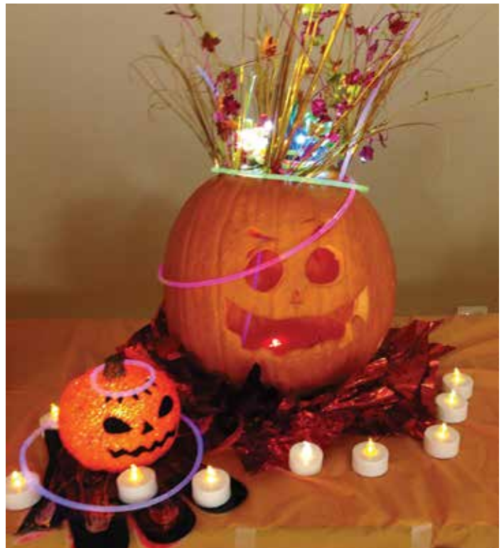
The winning jack o'lantern from Allied Health