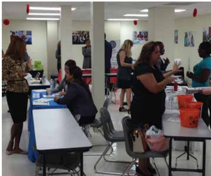
Students peruse the career fair