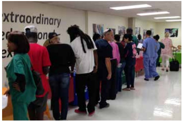
Students line up to meet the vendors at the career fair