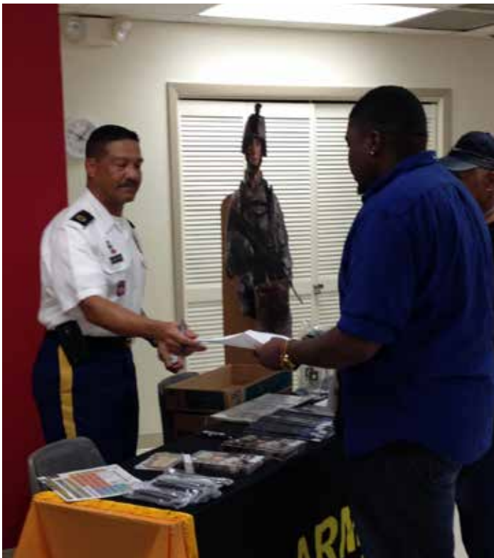
A student speaks with a representative from the U.S. army

Find us on Facebook. Visit the City College social media link at citycollege.edu/social