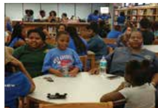
City College Ambassadors and other organizations gather to hear speaker for Anti-Bully march