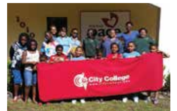
Staff, Student Ambassadors and families of City College join Pace Center for Girls Anti-Bully March, Friday October 30, 2015