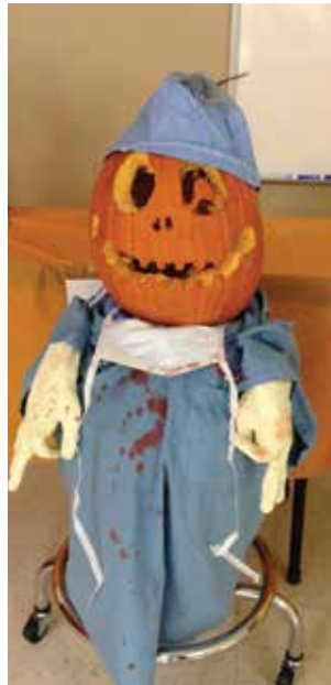
Surgical Tech's jack o'lantern, the first runner up!