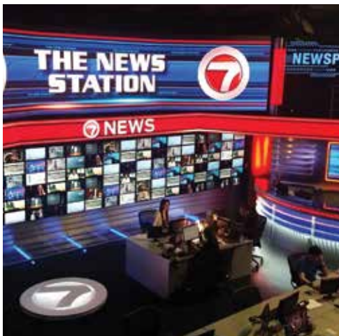
Channel 7 News station welcomes the Broadcasting Department

Find us on Facebook. Visit the City College social media link at citycollege.edu/social