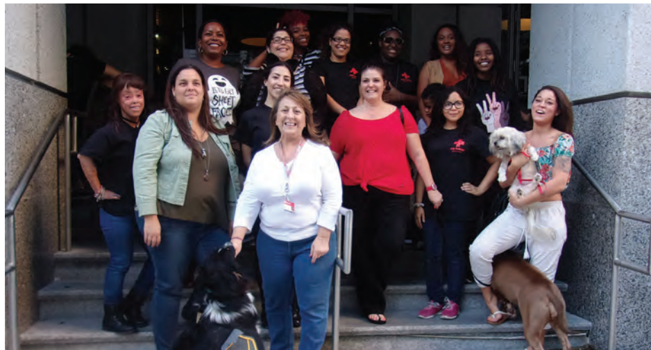
SCANAVTA Howlaween participants and their pets