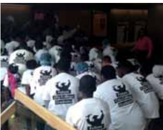
Students from the Boys and Girls Club of Broward prepare for their orientation and tour