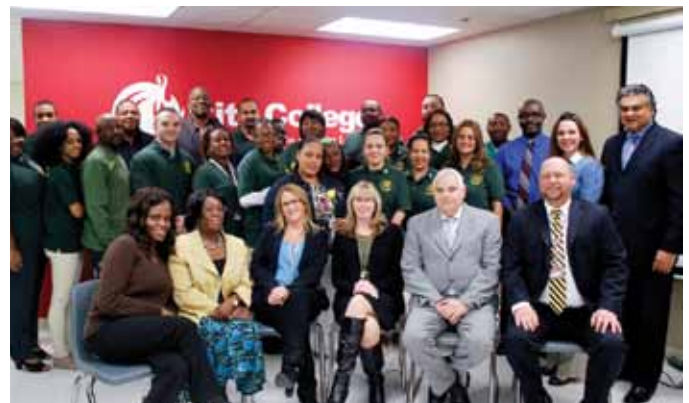
Faculty, Staff, and Student Ambassadors pose during the Student Ambassador Induction Ceremony. 16 students were honored as inductees during the November ceremony