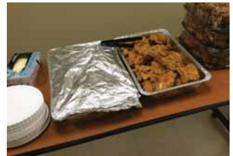
Food for the Gainesville Campus Awards Ceremony, purchased through a community relationship with Publix Supermarkets

The Gainesville Campus embraced the autumn weather and got into the Halloween spirit in October. Student Appreciation Week fell during the week of the holiday and the campus celebrated with an Autumn-themed week of activities for students, faculty and staff. The individual departments worked together to provide the students with a weeklong celebration of their academic achievements and their enthusiasm for the City College experience. The event involved a scavenger hunt, a costume contest, and a coffee service, as well as the student awards and pinning ceremony.