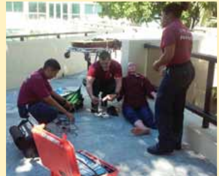
Miami students are about to perform a PT assessment on a fifty year old homeless male who was experiencing altered mentation