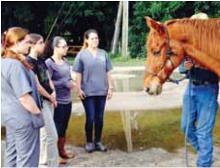
Veterinary Technology students on site at Bar-B-Ranch in Davie, Florida where they had an opportunity to complete exams, injections and even trim the hooves of their animal residents