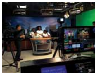
The Broadcasting Department demonstrated the many aspects of a working television studio to the visiting Boys and Girls Club students