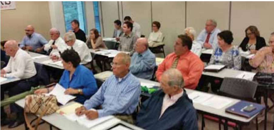
The Miami campus hosted the Florida Society of Enrolled Agents Miami-Dade Chapter Monthly Meeting. Members are licensed by the U.S. Department of the Treasury to represent tax payers before all administrative levels of the IRS