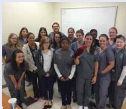
Incoming Fall Term 2014 Gainesville Campus Veterinary Technology students in the Introduction to Veterinary Profession class

Visit the City College student web portal at myportal.citycollege.edu