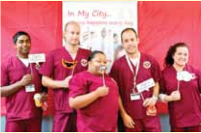
Nursing students participate in some of the fun Student Appreciation activities