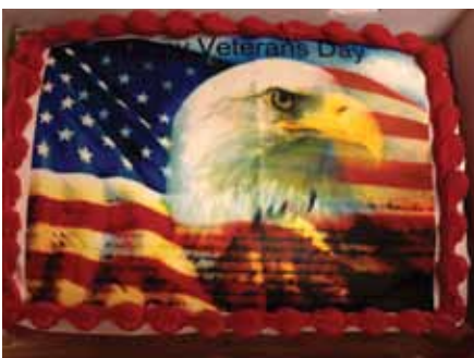
The cake presented to faculty and staff in honor of Veteran's Day

Find us on Facebook. Visit the City College social media link at citycollege.edu/social