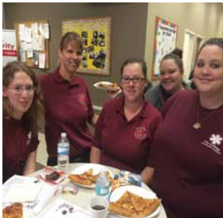
Gainesville Campus EMS students enjoyed some Gainesville Campus pizza