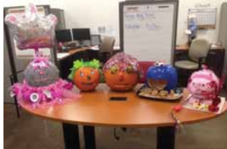
Pumpkins provided and decorated by the Gainesville Campus Admissions Team for the week's festivities