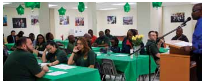
Faculty, Staff, and Student Ambassadors pose during the Student Ambassador Induction Ceremony. 16 students were honored as inductees during the November ceremony