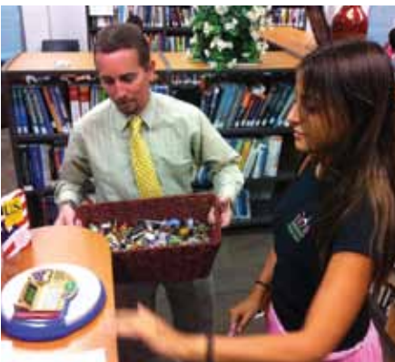
Miami students celebrate Constitution Day by playing some Wheel of Fortune trivia with a chance to win some candy