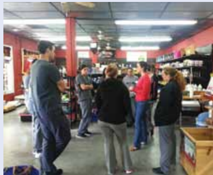
Gainesville Campus Veterinary Technology students learning about non-domesticated animals during an off-site trip