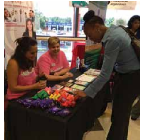
PRIDE Center staff from Wilton Manors passing out literature on Health and Wellness