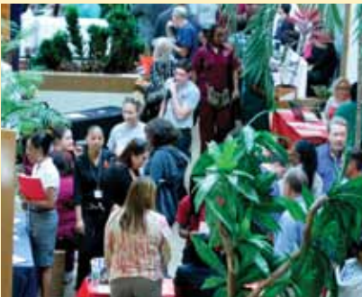
Students enjoy the Career Fair during Student Appreciation Week

awards for outstanding academic achievements to students during the festivities. The week was designed to express City College's appreciation for its students. ●