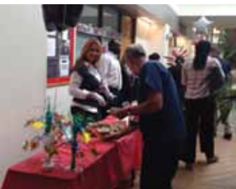
Students wait in line to "top their dogs"