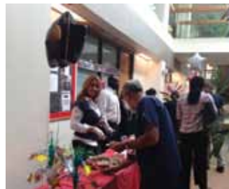
Breakfast is an important part of being prepared on "game day"