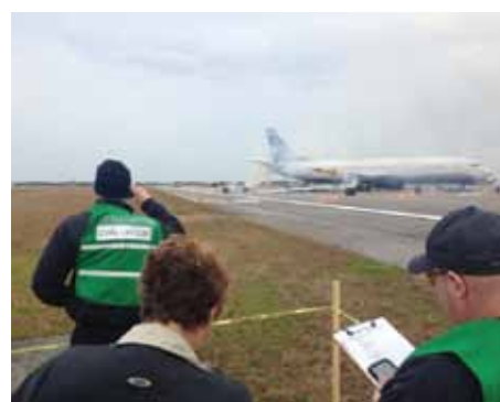
Simulated Plane Crash during Mass Casualty Event

"This was a great experience for our students. They got to work with agencies they will have close relationships with when they are working in the field after graduation."