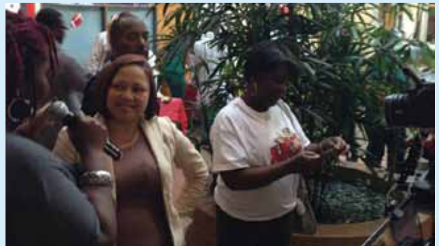
Students wait in line to share their Extraordinary Educational Experiences with Flexx FM

Visit the City College student web portal at myportal.citycollege.edu