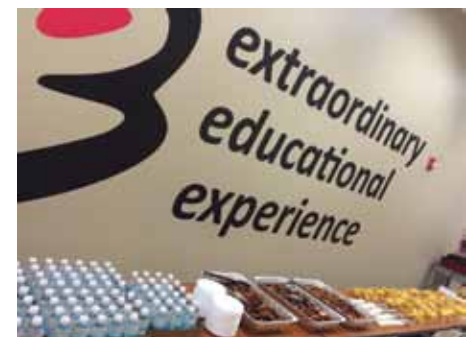
The wing buffet enjoyed by Gainesville Campus students during Winter Term 2015 Student Appreciation Week