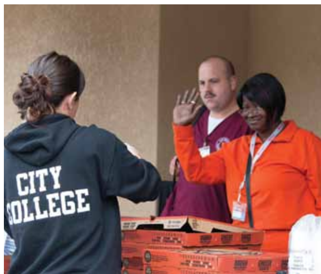
Students in line to get pizza before Awards Ceremony

Students enjoyed having a DJ on campus for Awards Day. Faculty and staff grilled hot dogs, served pizza and enjoyed a time of fellowship with the students. ●