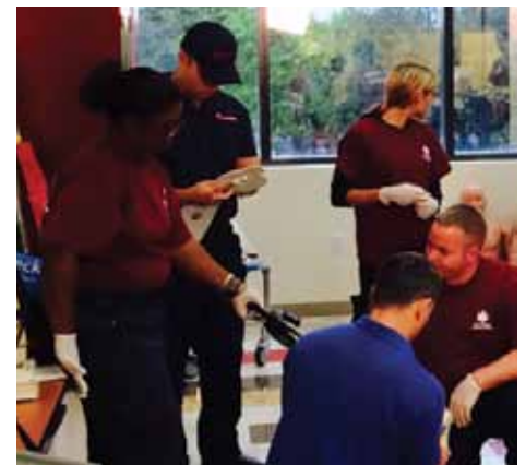
EMS students & faculty demonstrating how to place a patient on a board for transport