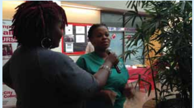
An Allied Health student shares her experiences of City College with Flexx FM