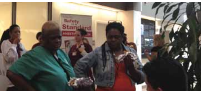
Students talk with one of the vendors on campus during Student Appreciation Week