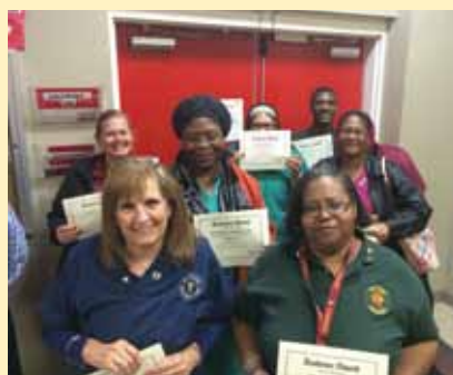
Gainesville Campus students with their awards certificates at the Student Awards Ceremony