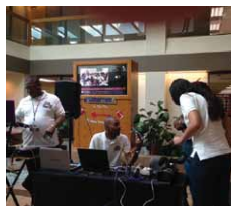
Employees from Flexx FM set up for their live broadcast from the City College atrium on the Fort Lauderdale campus