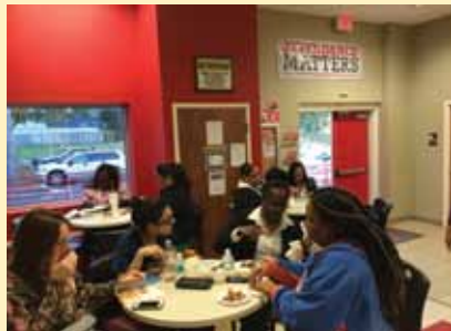
Students enjoying the food and festivities during Gainesville Campus Winter Term 2015 Student Appreciation Week