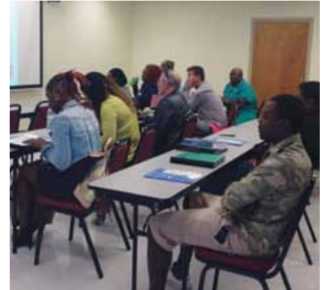
Students listen to presentation on the importance of credit in their lives