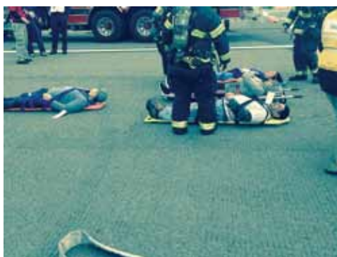
EMS students participating as patients in local Mass Causality Event