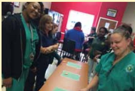
Table Football! Gainesville Campus student compete during Winter Term 2015 Student Appreciation Week