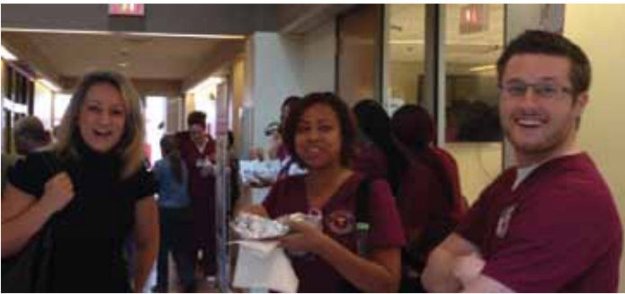
Students enjoy the "SuperBowl" festivities during their class break