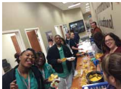
Gainesville Campus students enjoy Nacho Day during Winter Term 2015 Student Appreciation Week