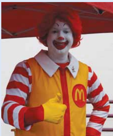
Ronald McDonald at the festival handing out lunch and prizes

9:30 AM- 12:30 PM: Kids Activity Areas 12:30-2:00 PM: Lunch, diapers, formula, and prizes Ronald McDonald Appearance, Book Give-Away