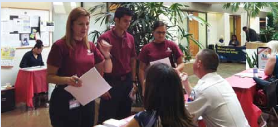
EMS students practiced their networking skills with one of the vendors represented at the job fair

On February 12 th , City College students had an opportunity to practice their networking skills at the City College job fair. Vendors who turned out for the fair included Securitas Security, Senior Nannies Home Care Services, Advocate Home Care Services, Medics, Convergys, AFLAC, Macy's, Apple One Staffing, DLA (Digital Latin America) and Florida Community Support . Several connections were made and some interviews were scheduled.