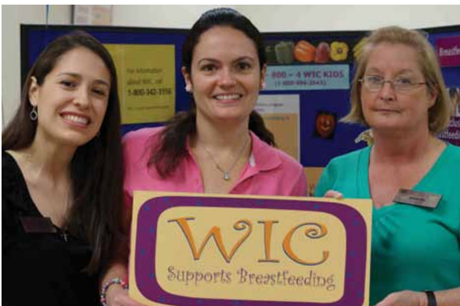
WIC staff members

Find this newsletter online at citycollege.edu