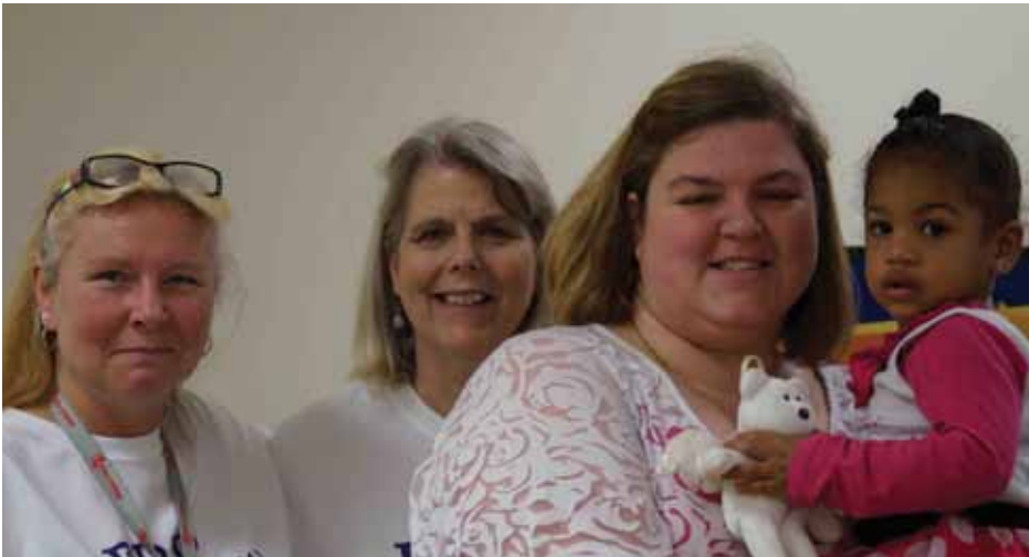
DCF staff and Student Ambassador posing with a client