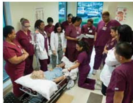
A nursing student completes a postoperative check while instructors and students look on