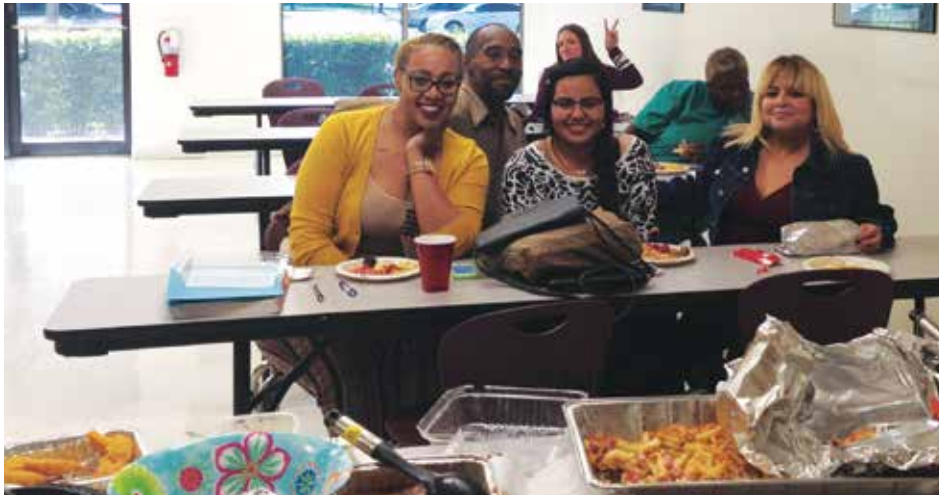
Students enjoy some of the various cuisines shared by classmates during Culture Through Cuisine