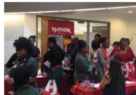
The Fort Lauderdale campus was busy with students meeting with prospective employers during the Career Fair