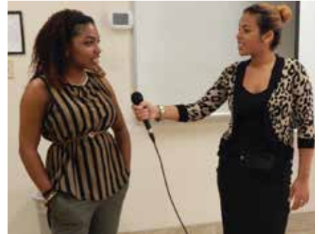
Broadcasting students demonstrate interview skills at the Boys and Girls Club Career Day