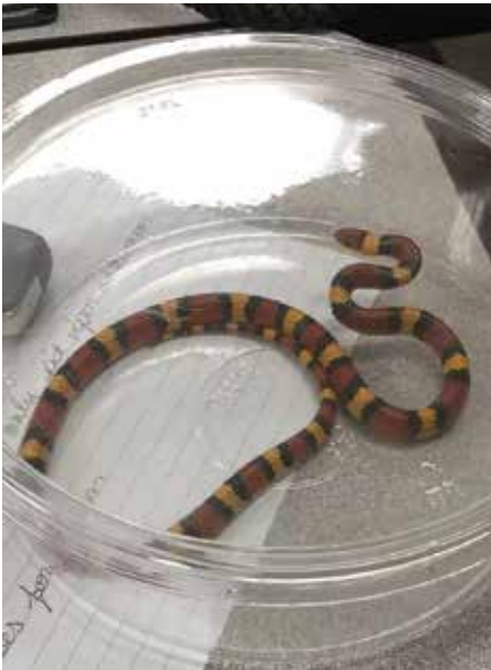
Milk Snakes bear a striking resemblance to coral snakes. While both milk snakes and coral snakes possess transverse bands of red, black and yellow, a common mnemonic can be used to properly distinguish between the deadly coral snake and the harmless milk snake: "Red touches yellow, not a nice fellow; if red touches black, good friend of Jack"

Seminole County's venomous snake specialist, taught students about the good, the bad, and the ugly during a venomous snake lecture