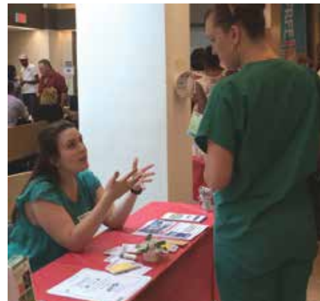
An Allied Health student gets some information during the Community Resource event held during Student Appreciation Week