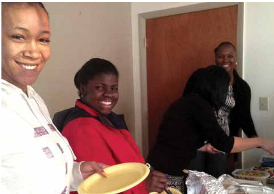
A variety of foods from around the globe were shared by students during Culture Through Cuisine