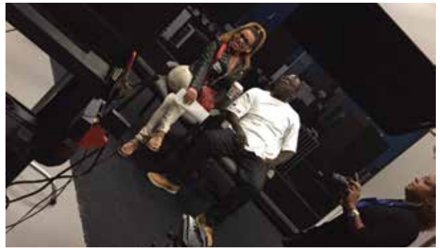
Students experience in-studio production during their trip to Atlanta