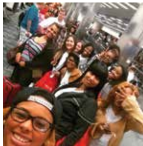
Broadcasting Club students are excited to depart on their next great adventure