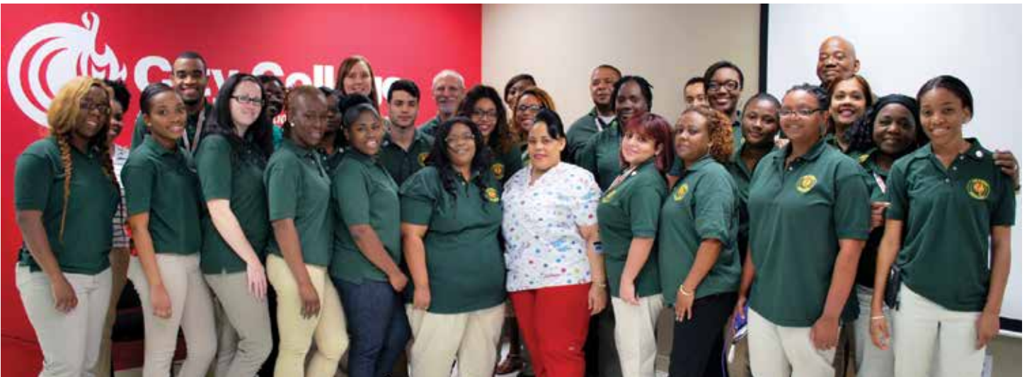
Congratulations to our Student Ambassador inductees Winter 2015