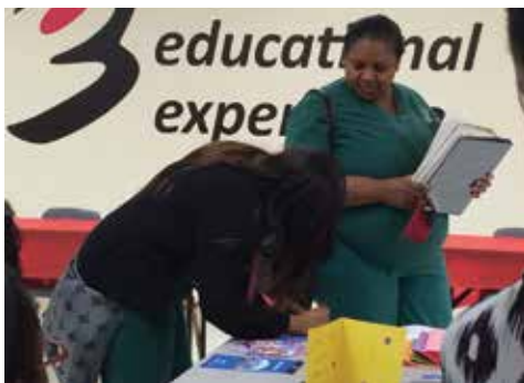
Students make "care cards" for Savannah's Cards 4Kids