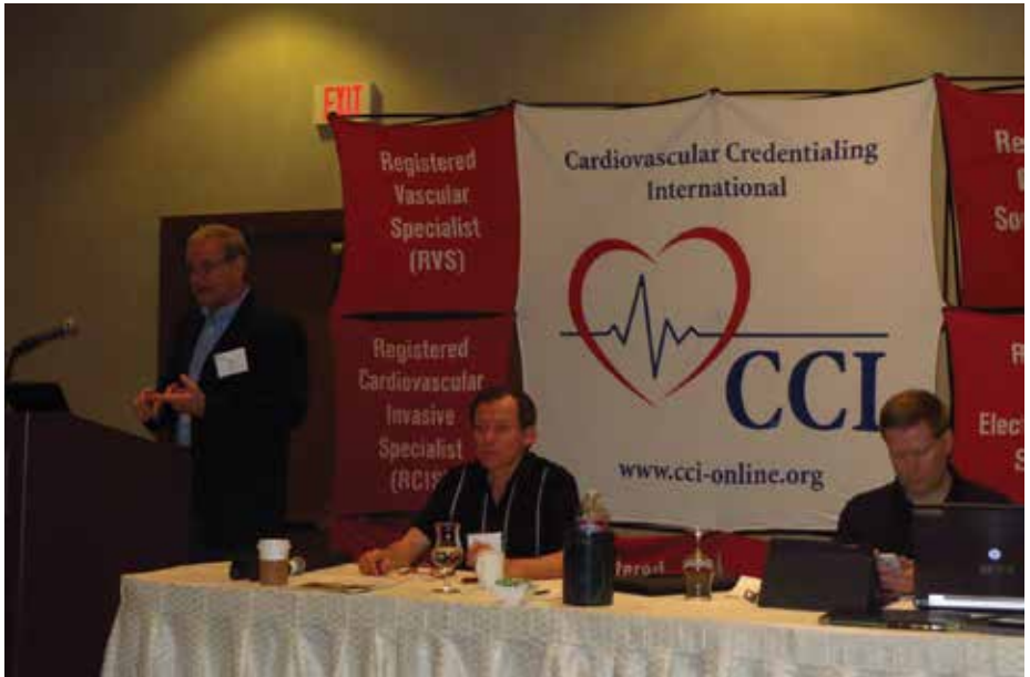
2015 Cardiovascular Credentialing International Clinical Educator's Meeting