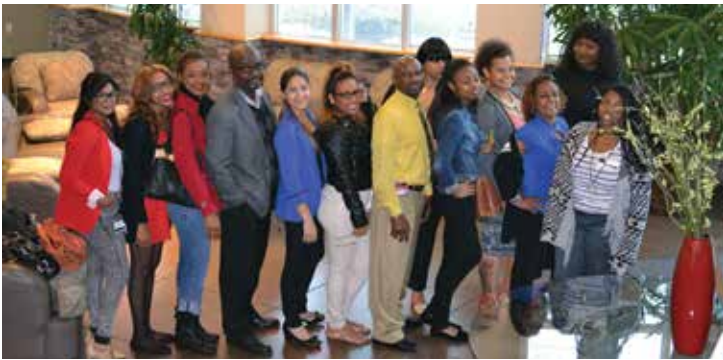
Broadcasting students show their enthusiasm during one of the tours