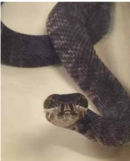
Cottonmouth snakes, otherwise known as water moccasins, are a medium sized snake, often growing to be four feet in length

Seminole County's venomous snake specialist, taught students about the good, the bad, and the ugly during a venomous snake lecture