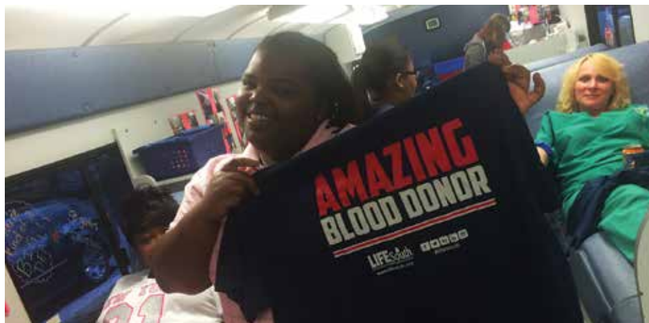
Gainesville Campus students become more amazing as they donate blood during the LifeSouth Blood Drive