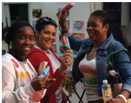
Students show their enthusiasm about City College while enjoying ice cream