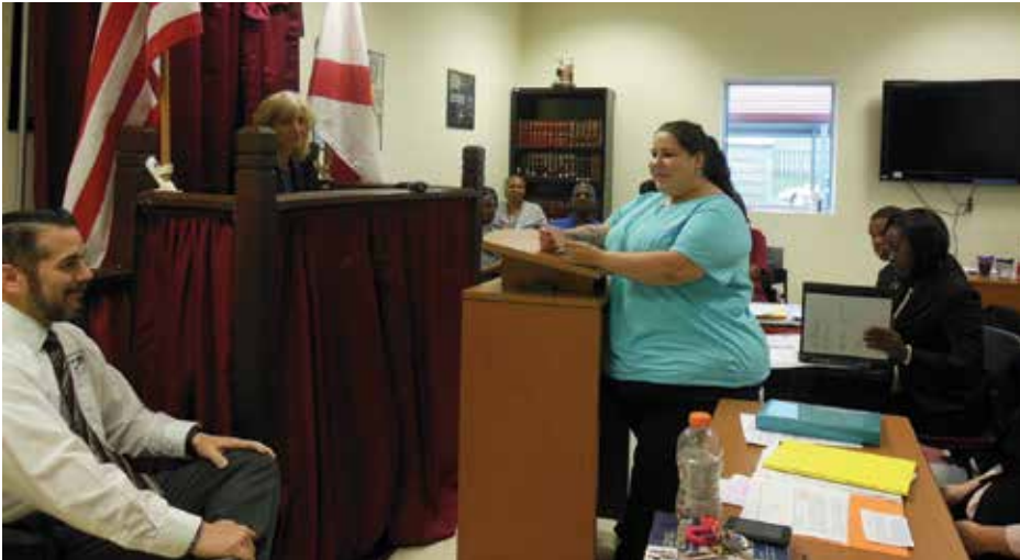
Gainesville Campus students and staff participate in a mock trial conducted by the legal assisting program