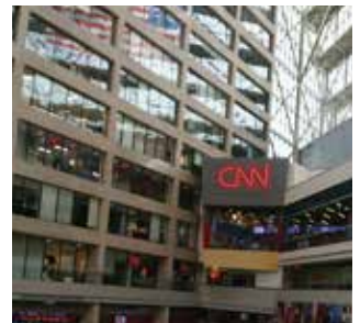
Students were able to visit the famous CNN building