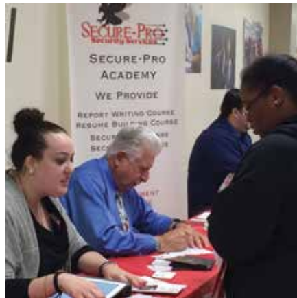
Students discuss employment opportunities during the Career Fair held during Student Appreciation Week

achievement, a community resource fair, spirit day, and was topped off with a career fair. Students were also able to enjoy donuts, pizza, ice cream, popcorn, and cake that were served by faculty and staff during their morning and evening breaks. ●